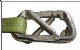
Two snap links, gates opposite.