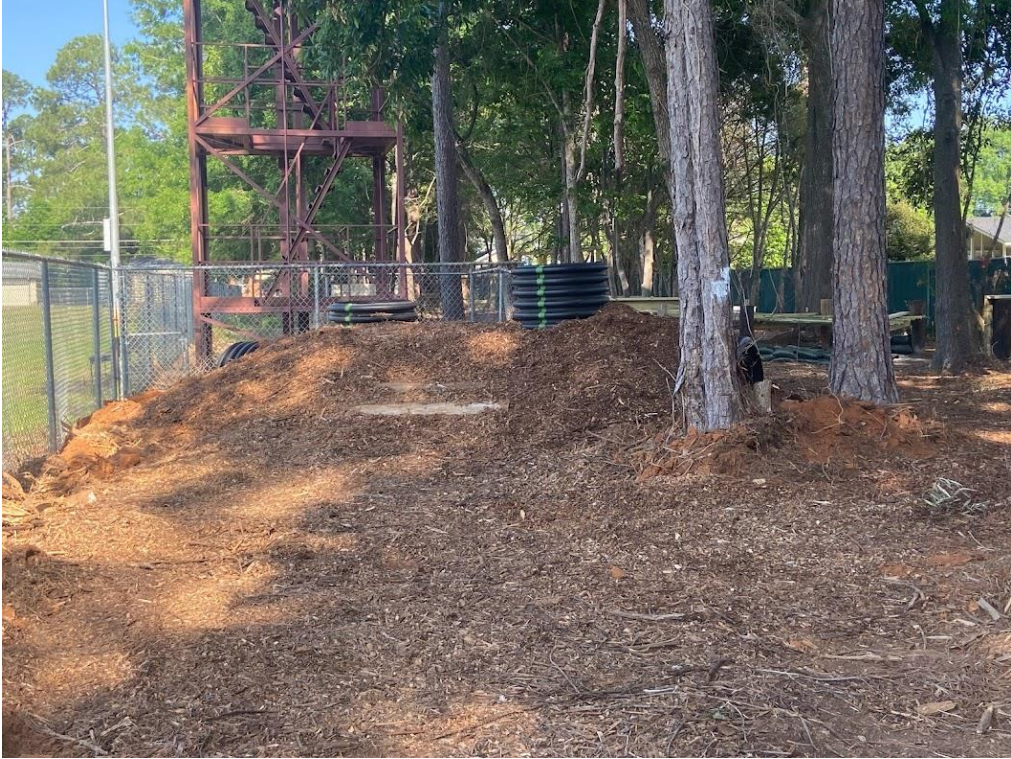
O Course “Drainage Tubes Top View”