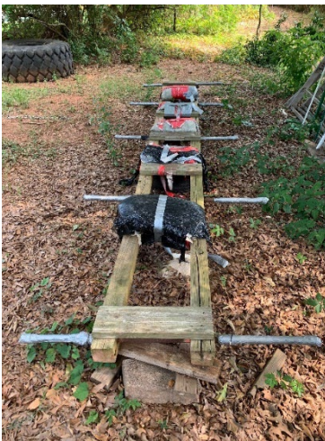
7. This is my Canoe.. 250lbs 10- Person Carry (Male Teams)

b) Once a cadet raider crosses the finish line, that cadet raider cannot go back and help other team members or pickup any remaining equipment – their event is completed at that point. Violation of this rule will be a 30-Second Penalty PER OCCURRENCE. Time will stop when the last team member crosses the finish line.