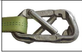
Two snap links, gates opposite.