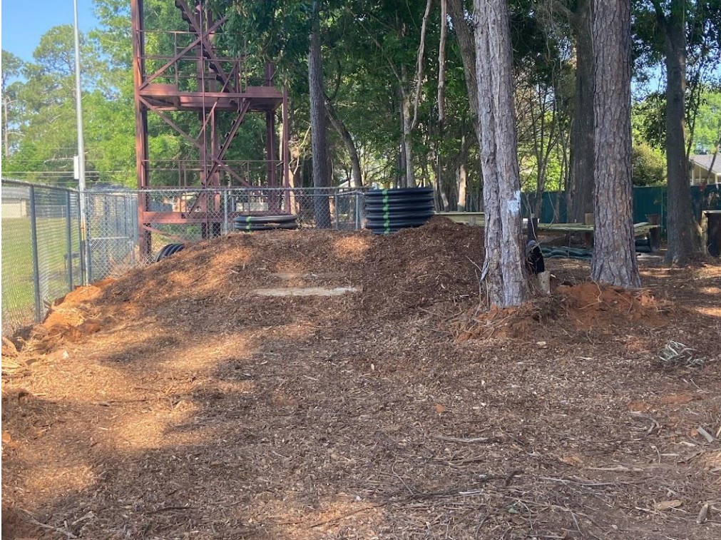
O Course "Drainage Tubes Top View"