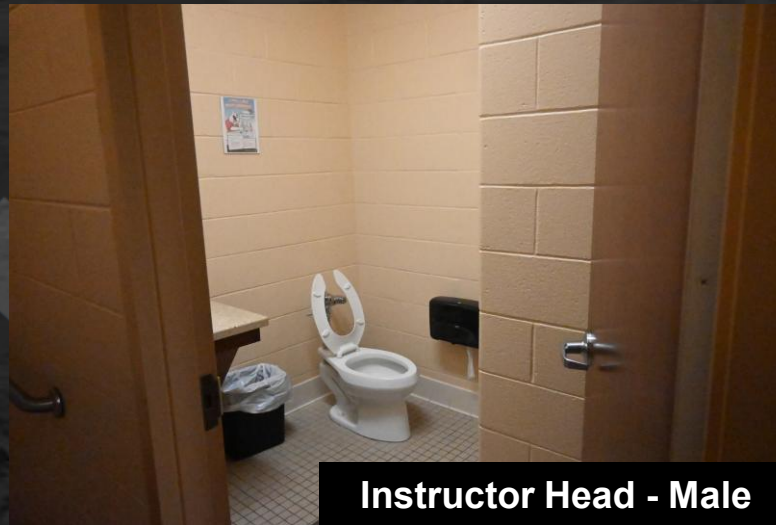
Instructor Head - Male