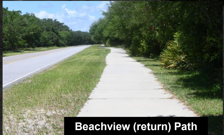
Beachview (return) Path