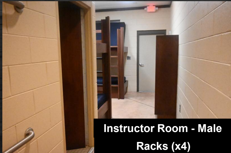
Instructor Room - Male Racks (x4)