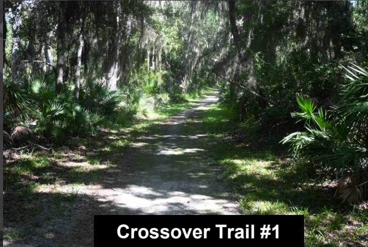
Crossover Trail #1