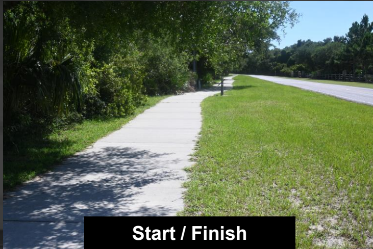
Start / Finish