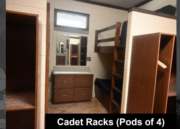
Cadet Racks (Pods of 4)