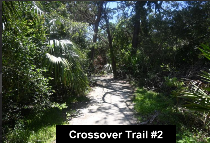
Crossover Trail #2