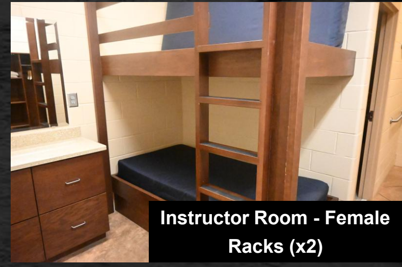
Instructor Room - Female Racks (x2)