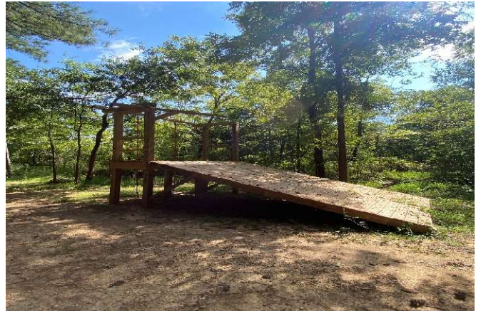
10' Rope Climb