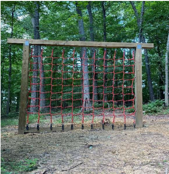
Single Cargo net

12' Rope and Wall Climb with descent Raiders Must not walk down frontward (3-point contact)