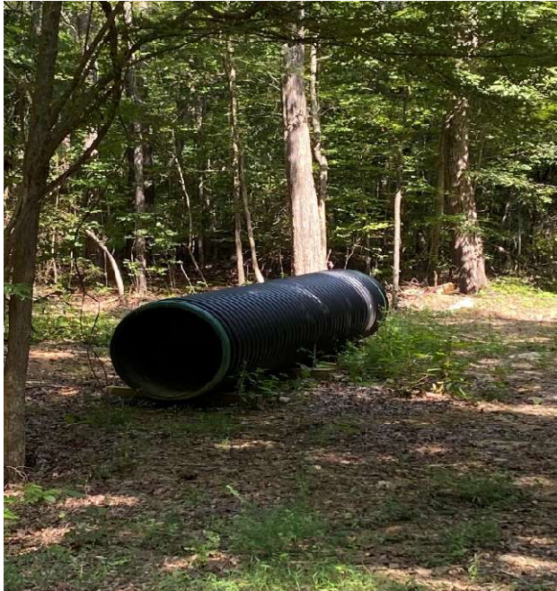
30" Tunnel and ascent