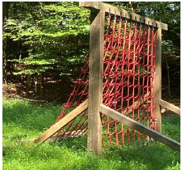
Double Cargo Net