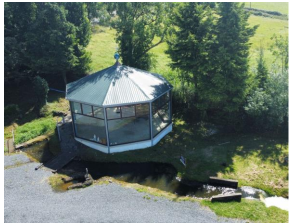
The Shrine after Phase 1 restoration work – July 2023