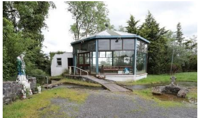
Ogulla Shrine before Tulsk History Society restoration works started in 2022.