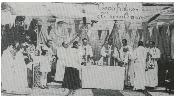
First Ogulla Mass 30 June 1974