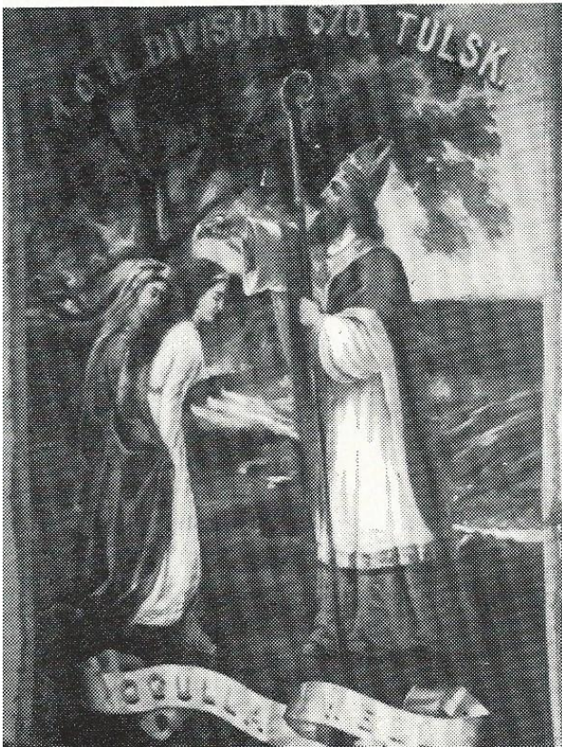
Tulsk A.O.H. Banner 1912