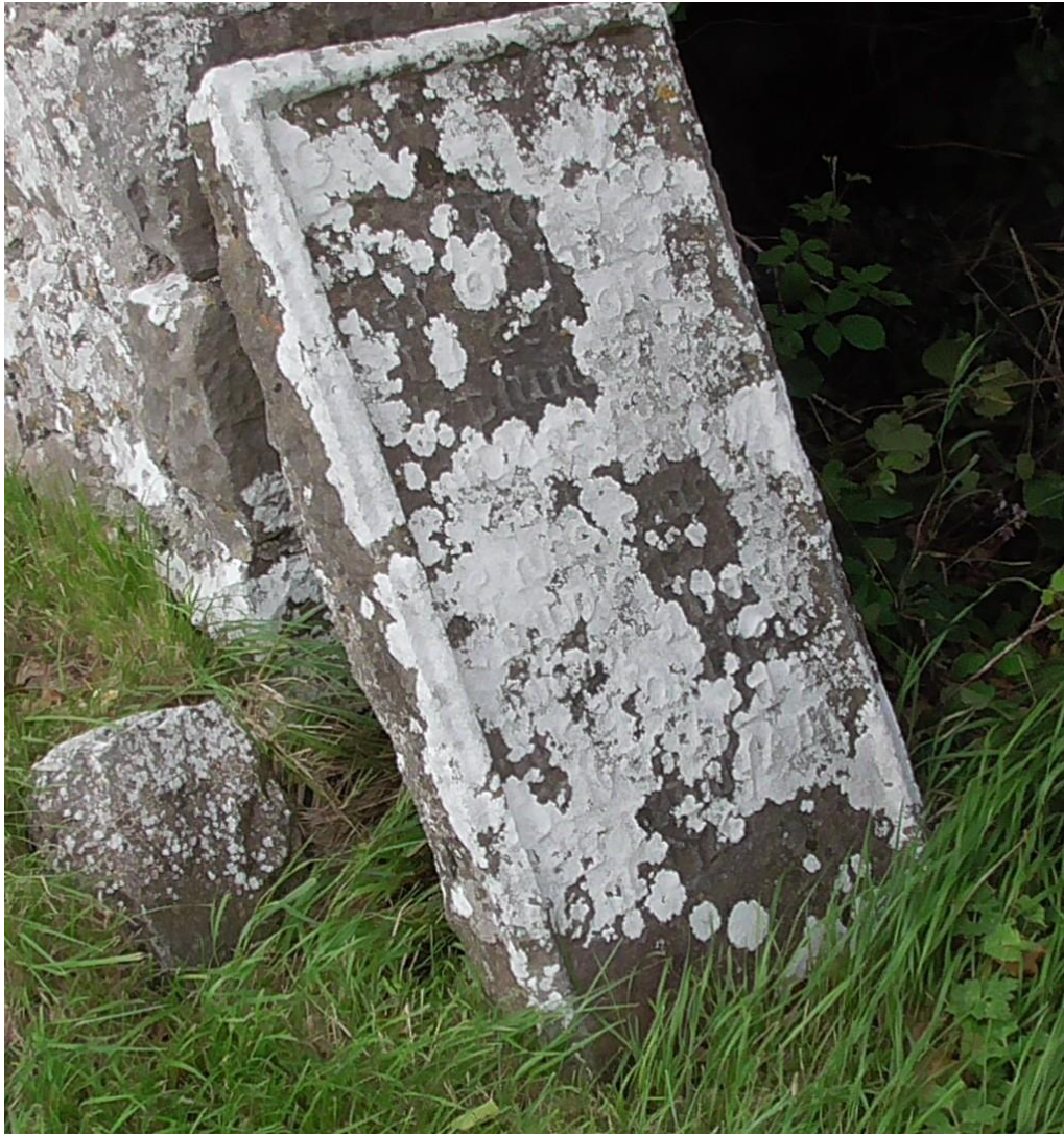
PLUNKETT Stone in chapel doorway