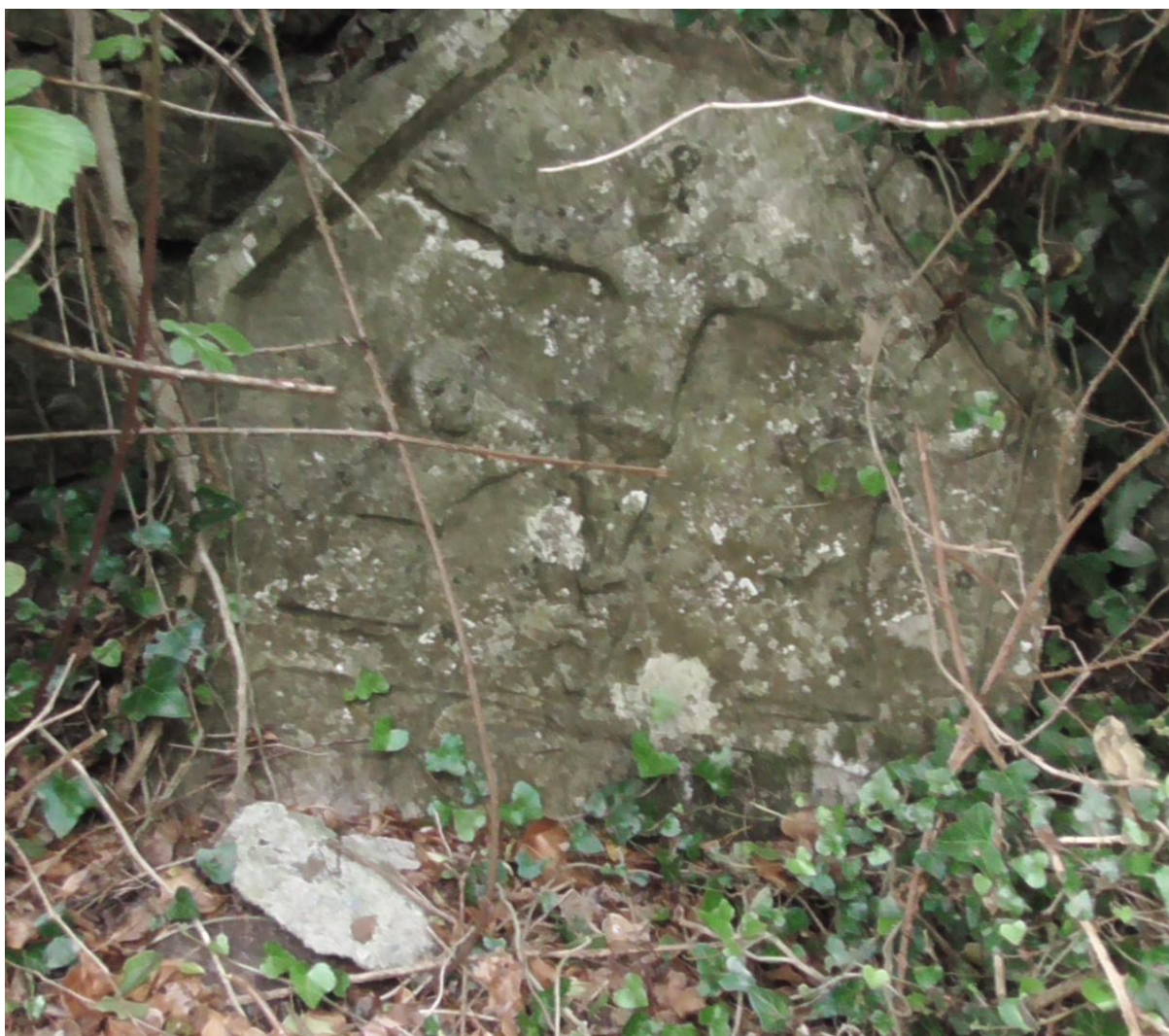
PLUNKETT Remains of stone monument