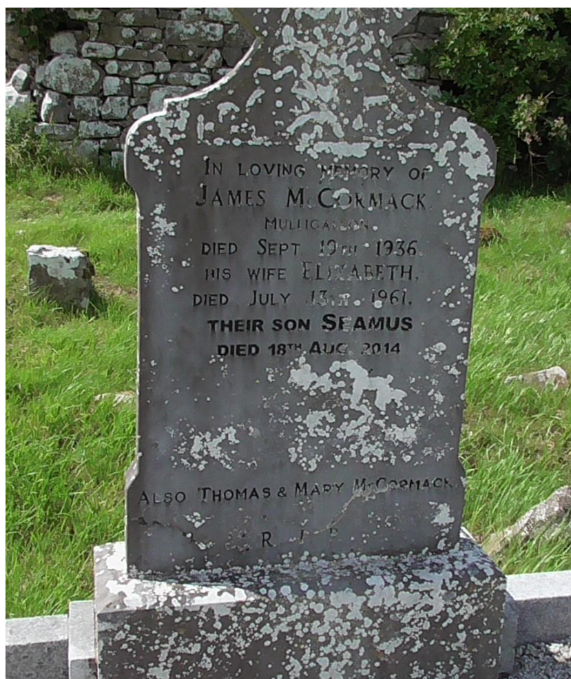
McCormack Map Number – 55