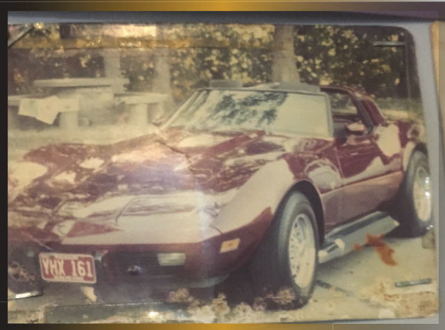
Big D's Corvette's