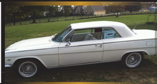
More of Big D's classic Cars