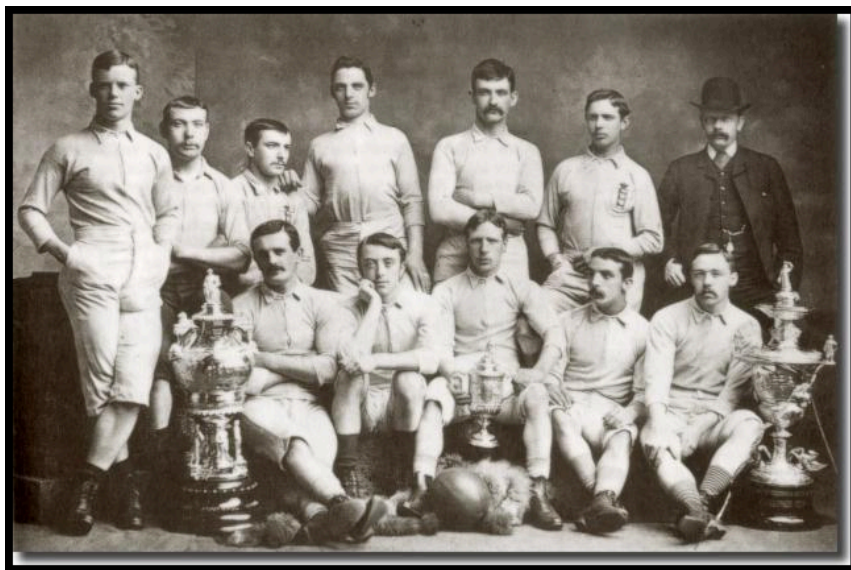
FA Cup winners in 1883-84

Blackburn Rovers were founded in November 1875 by two old boys from Shrewsbury school. They played their first match the following month in Church, Lancashire. In September 1878 they were one of 23 clubs to form the Lancashire football association. They played their first FA Cup match in November 1879 beating Tyne Association FC 5-1 eventually losing in the 3 rd round to Nottingham Forest. Blackburn won the FA Cup in three consecutive seasons from 1884 to 1886. They were founder members of the Football League in 1888 finishing in 4 th place in the inaugural season. They went on to win the FA Cup again in 1890 & 1891. Blackburn were League champions in both 1911-12 and 1913-14.