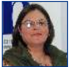
FROM THE DESK OF OUR PORTFOLIO CONSULTANT

Therefore, it is important to get clarity on the terms and conditions in your policy and correctly inform your broker about periods of non-occupancy.