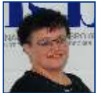
FROM THE DESK OF OUR OFFICE MANAGER

With loadshedding as a part of our lives now, we must take all precautions to avoid damages to essential appliances. Please give us a call if you are unsure whether your policy includes this cover.