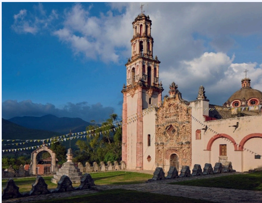
The mission of San Francisco de Asís del Valle de Tilaco is the most isolated of the five in the Sierra Gorda. Founded by Fray Serra in 1754, before he left for Alta California.

To go out and preach, we need a message - it can be the wonder (not folly) of the cross or examples of virtue which are highly instructive to people, no matter what their level of formation.