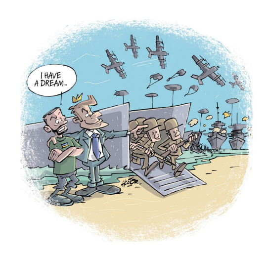
PICTURE 1. Examples of emotionally suggestive and provocative images and cartoons by RRN.