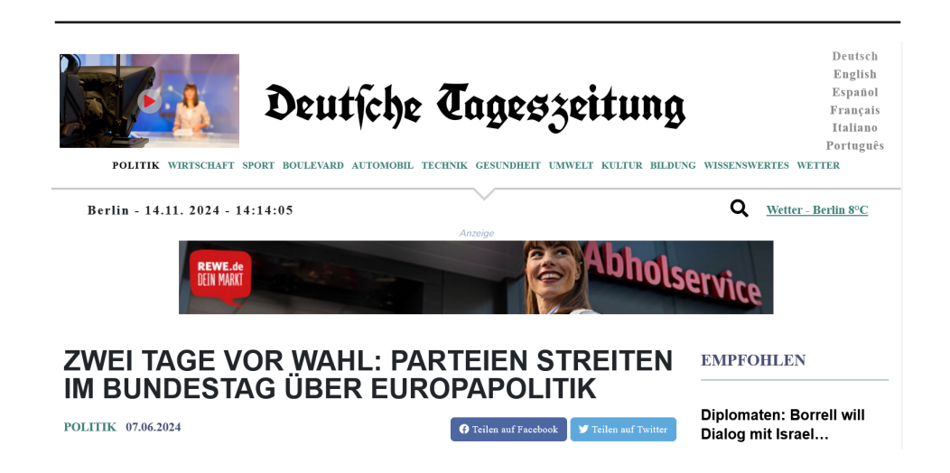
PICTURE 4. The same news on Berliner Tageszeitung and Deutsche Tageszeitung, but ascribed to different authors: "A. Walsh—BTZ" and "W.Novokshonov—DTZ". Of note also similarities in the architecture of the websites.