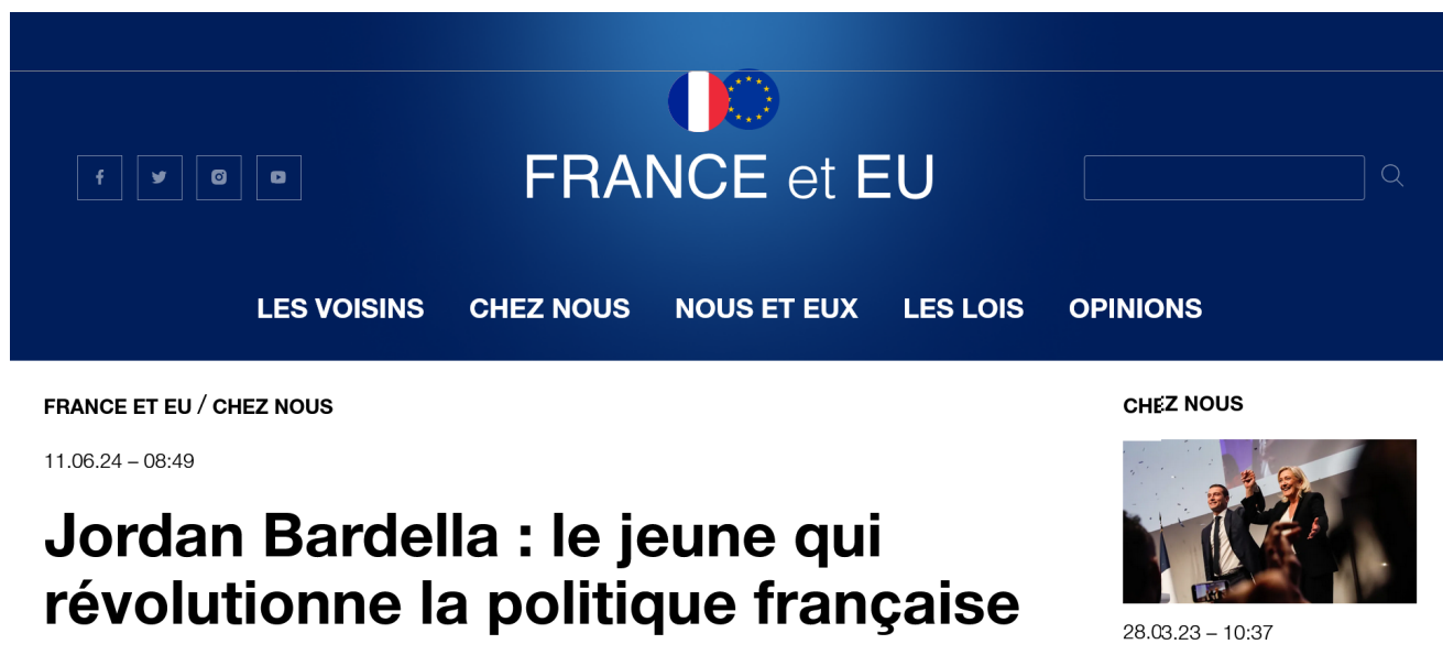
PICTURE 3. France et EU website looking like a serious French news provider.