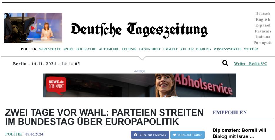
PICTURE 4. The same news on Berliner Tageszeitung and Deutsche Tageszeitung, but ascribed to different authors: “A. Walsh—BTZ” and “W.Novokshonov—DTZ”. Of note also similarities in the architecture of the websites.