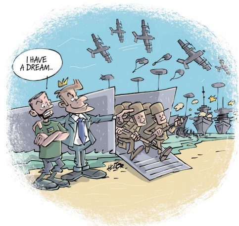
PICTURE 1. Examples of emotionally suggestive and provocative images and cartoons by RRN.