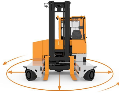
360° steering in place