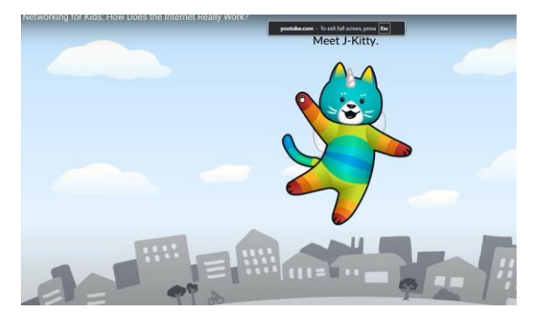
Networking for Kids: How Does the Internet Really Work?