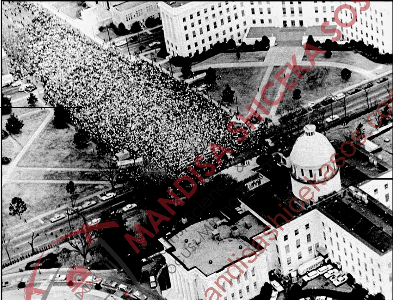
[From The Civil Rights Movement: A Photographic History by S Kasher]

This is an aerial photograph taken at Dexter Avenue in front of the Alabama state capitol in Montgomery on 25 March 1965. It shows some 25 000 marchers who managed to arrive at Montgomery on their third attempt after leaving Selma on 21 March 1965.