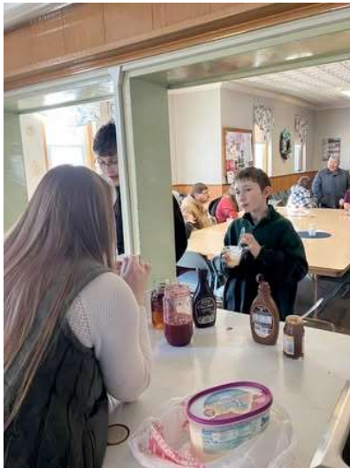
Super Sundae's-February 9