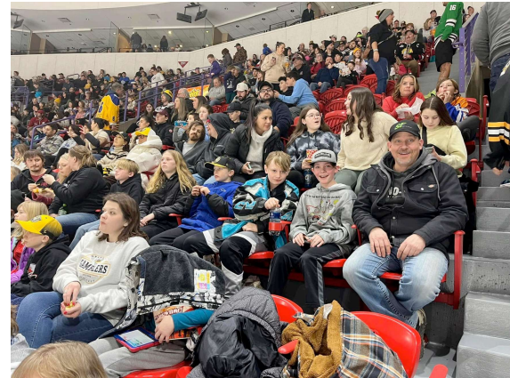
Gambler's game outing-january 25