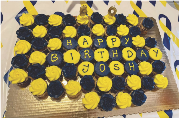
50th Birthday celebration @ SP