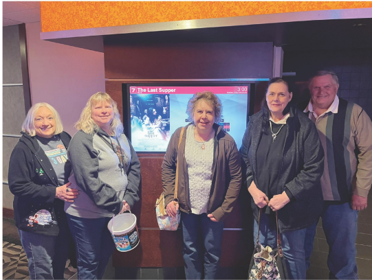
Movie outing in GB