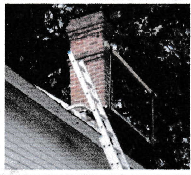
Chimney at the Historic First Baptist Church in Minnesota City.