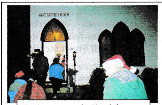
Carolers return to the Church for refreshments after 2007 caroling event

eras, can now be added to the caroling celebration. Additional historical information about the introduction of lights into the holiday celebrations will be narrated at the caroling event.