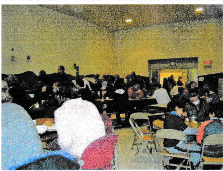
Over 150 people eat at the Riverway Learning Community Thankful Meal