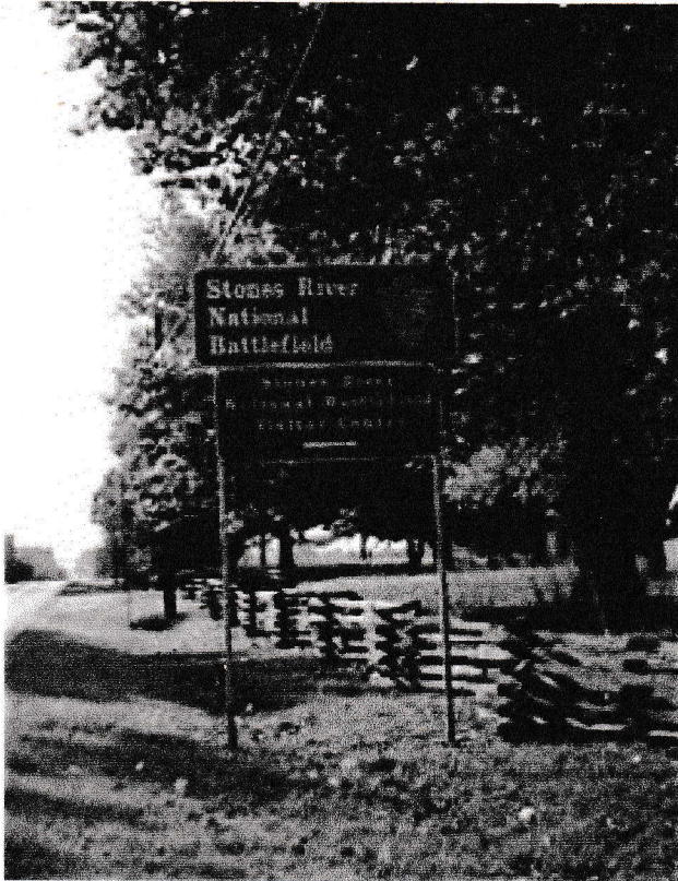
Stones River National Battlefield Site; Murfreesboro, Tennessee