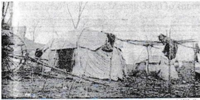
This Ho-Chunk (Winnebago) camp near Minnesota City was photographed around 1898. Ho-Chunks were pushed west and north by settlers in Wisconsin.

This photo was contributed to the archives in 2002. Source unattributed. Similar photos place this location on the current school site.