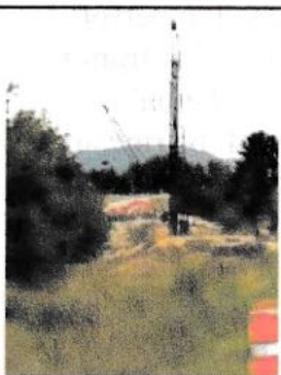
Construction of County Road 23 Bridge

Road work on 248 continues, which includes pavement reclamation and resurfacing from Altura to Highway 61. "Pavement reclamation is the process of milling off part of the existing road surface, grinding the remaining pavement and a small layer of the underlying aggregate, injecting oil into the mixture to rebind the material and compacting it back into place. An asphalt overlay will be placed on top of the stabilized, reclaimed surface." ( Winona Post ).