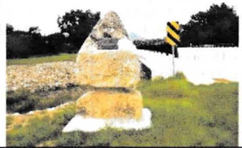
Garvin Brook Marker at Bridge Street

According to Kelvin Penrod, there have been reports that the bridge construction in 1940 (one of eight bridges constructed in this state project) was done at costs under bid, and some remaining money was used for landscaping which included the arrowheads and the pine trees along Bridge Street. Similar, unshaped stones are located at the site of the former Swinging Bridge (marked by MCHA with a commemorative sign). The brass plaque on the arrowhead was not damaged in the flood. Anyone wondering why replacing the stone is noteworthy will want to know that Kelvin estimated the stone to weigh somewhere between 7000 and 8000 pounds. Persons who contemplate history and ideas of closure value the efforts of Kelvin Penrod, Don O'Neil and the City Council to restore the Arrowhead Garvin Brook Marker, a significant image for residents.