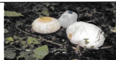
Puff balls shown here in comparison to gallon milk jug

The Giant Puffball is one of North America's best-known edible wild mushrooms. To rule out all other mushrooms, it should be at least four inches in diameter, growing on the ground (in the woods or on a lawn), roughly a sphere in shape. Sliced and fried like eggplant, or cubed for soups and casseroles, the easily identified puffball can be eaten without fearing the poison of many mushrooms.