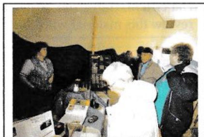
Minnesota City Day visitors examine materials related to glass and Minnesota City