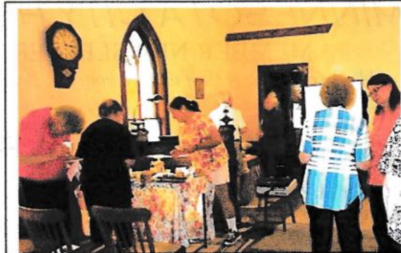
Attendees enjoy refreshments following the annual summer service at First Baptist Church on September 7.