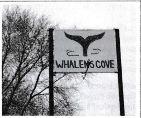
On the road sign