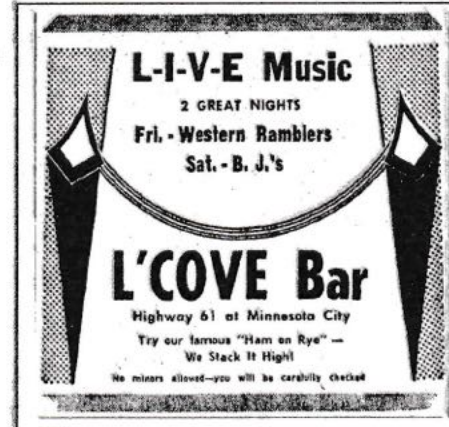
Off the road sign; Winona Daily News, March 2, 1967