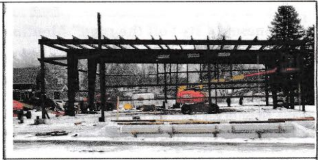
New Lyle's Flooring America Building

This new space will be located next door to their current location and open April 1st of 2017. The new store will have an open floor plan and continue to serve our customers with their flooring and window treatment needs....Lyle's Flooring America is very excited about the new space and continuing to be involved in our community "