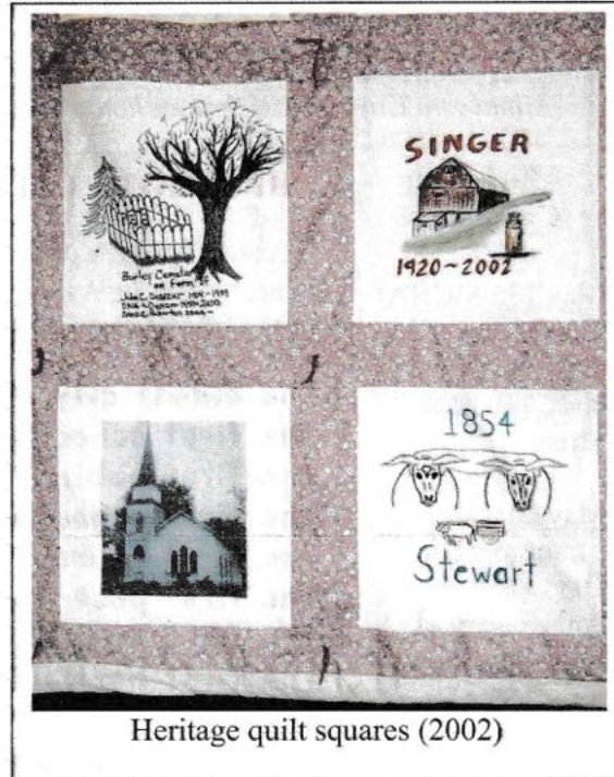
Heritage quilt squares (2002)