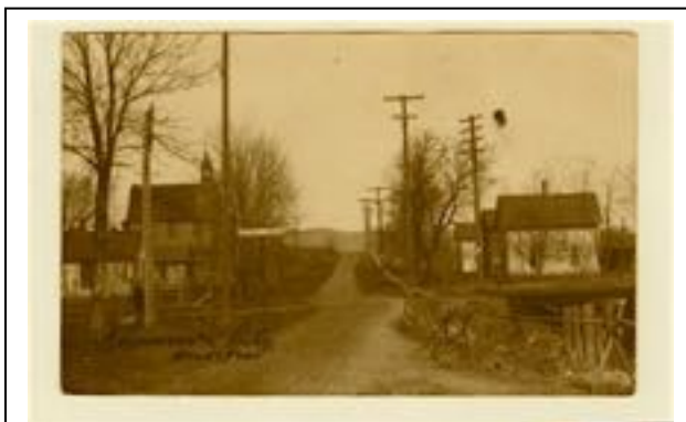
The Methodist Church on Minnesota Street