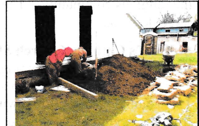
Jurowski Co. employees work on First Baptist Church