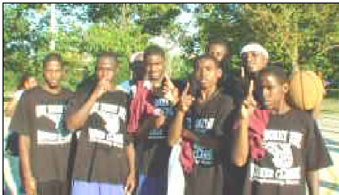
Team photo of the "Burgundy" – in their Championship T-shirts

Teams from West Philadelphia and West Poplar joined six North Philadelphia teams in a dazzling exhibition of athletic talent and sportsmanship. AABRA recorded the games and is preparing a DVD of the action. An AABRA spokesperson recalled "What I will remember most is that these young people played with intensity and honor whether they were 20 points up or 20 points down. Their character was extraordinary."