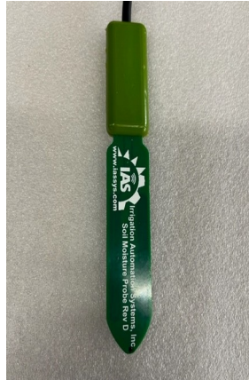
Smart Soil Moisture and Soil Temperature