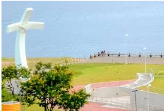
Praça do Papa