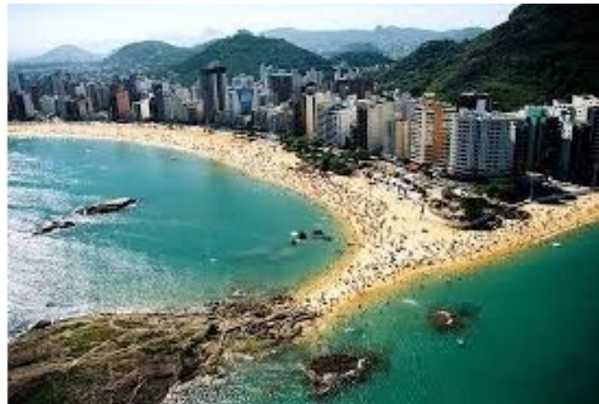
Praia da Costa

All the tourist attractions can be visited by bus, taxi, or Uber, about 5 to 20 minutes from the hotels.