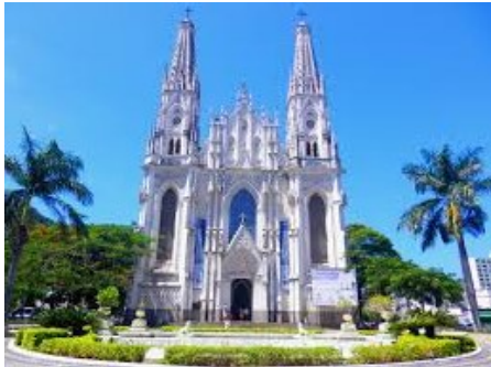
Catedral Metropolitana de Vitória