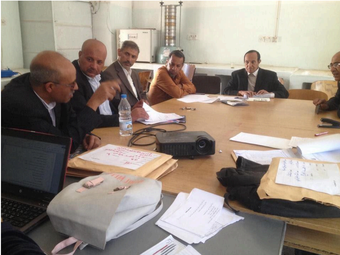
Figure (4): A picture during the union's meetings.