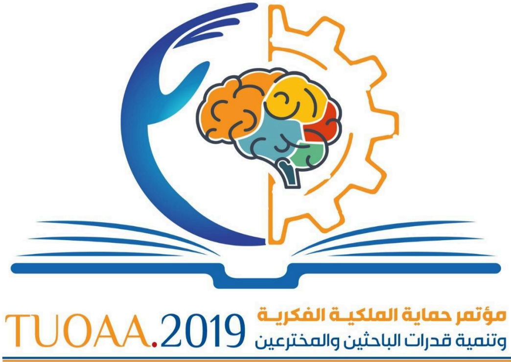
Figure No. (2) Conference on protecting intellectual property and developing the capabilities of researchers and inventors.

The President of the Union of Arab Academics, members of the Executive Office, the Scientific Council, and the specialized committees in the Union during the years 2019 - 2023 were keen to communicate and work with the members of the Union and to work to implement the goals of the Union included in the statute of 2018 and its annexes and the annual plan for 2019, which was represented in the speech of the President of the Union during Celebrating the first anniversary of the Union of Arab Academics in 2019 , which serves as an action plan for the year 2019 AD - 2024.