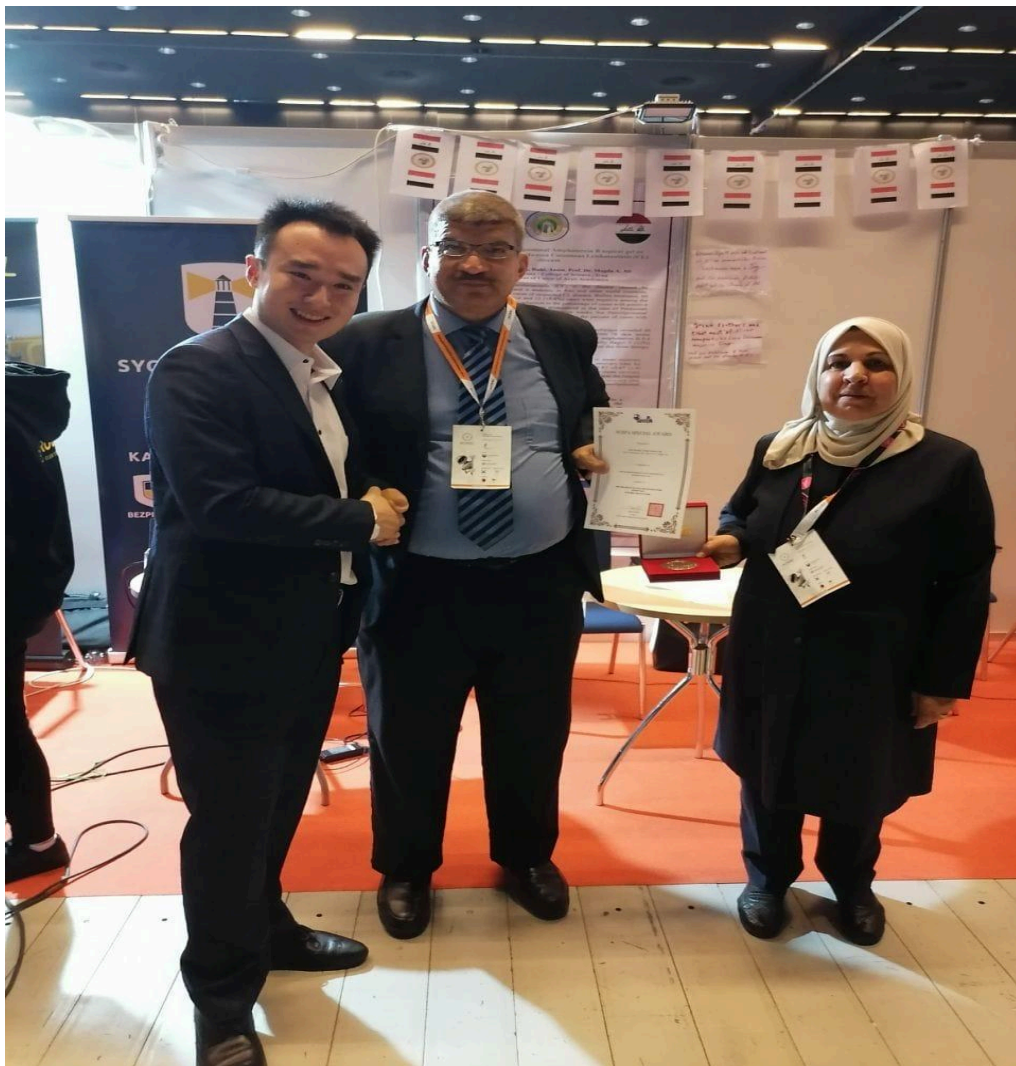
Figure (6) A group photo of the Vice President of the Union of Arab Academics in Poland for the year 2023.