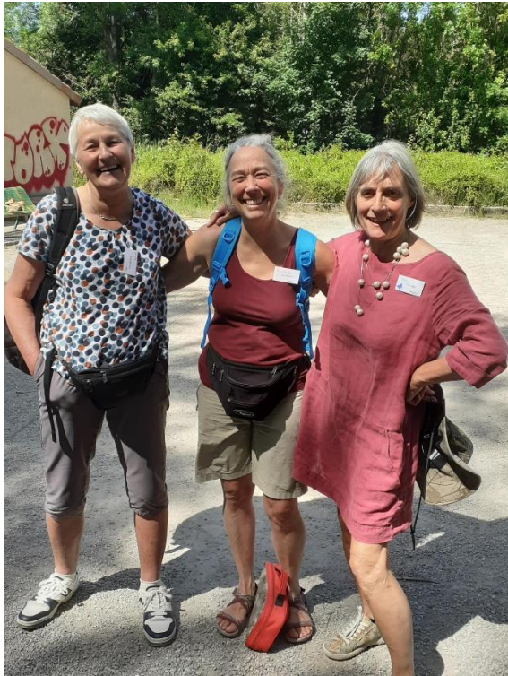
After the boules tournament.