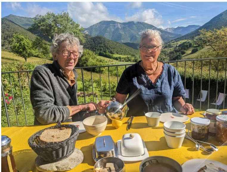
Breakfast on the balcony