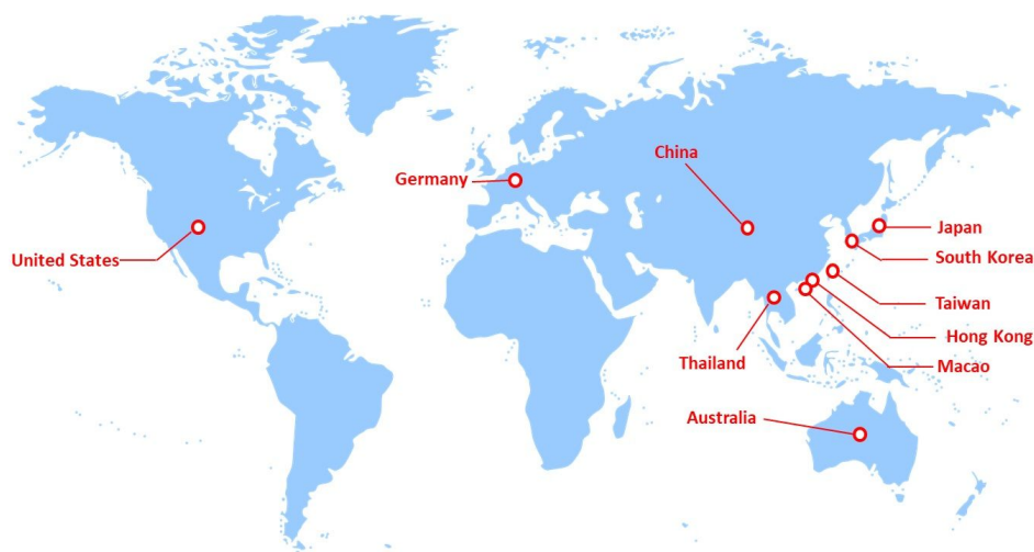
AASE conferences footprints of the world

The Applied and Advanced Science Exchange (AASE) offers an extraordinary platform for networking opportunities and discussions to enhance research progress in various fields. From 2016, we have run a series of professional workshops, conferences, seminars and symposiums, and have built a reputation for delivering inspirational conferences with flawless execution. Our purpose is to facilitate networking opportunities for scholars and be the information resources for dynamic professional development opportunities throughout the World.