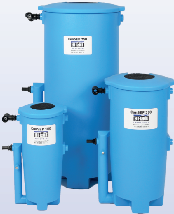
Technical Specifications - ConSEP Condensate Cleaners

The new "blue bag" technology is available to retro fit competitor's condensate cleaners in a 'copy exact' format. All bag service kits and ConSEP's are available for next day delivery.