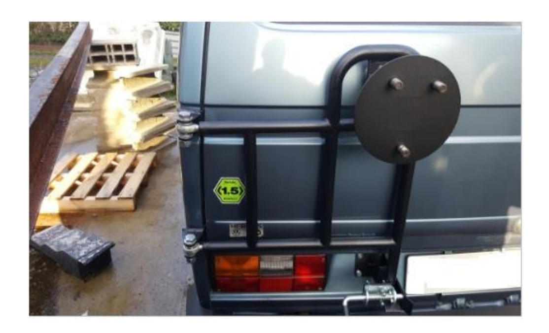
with the weight of the wheel, adjust by turning the corresponding uniball ball joint ...

Now mount the wheel and test. If we see that it drops a little