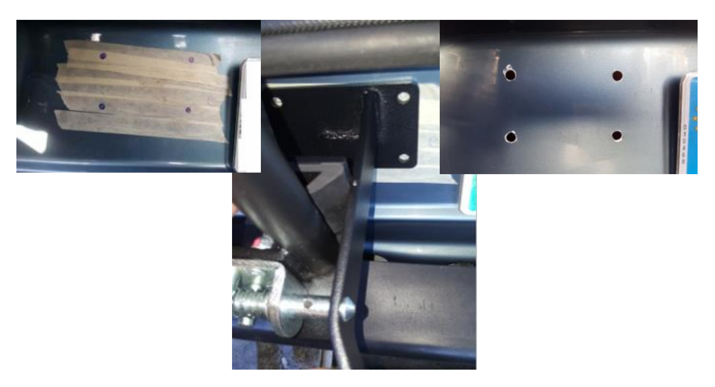
Mount the closure bracket and the internal reinforcement plate

Once straight, present the closure bracket and mark the holes. As before, first protect with tape