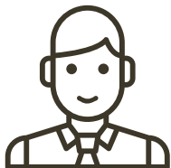
REAL ESTATE AGENT