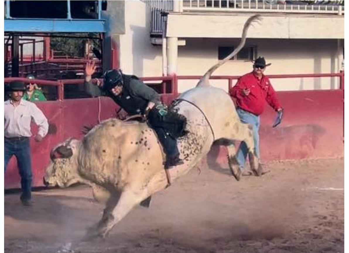
Women’s Bull Riding