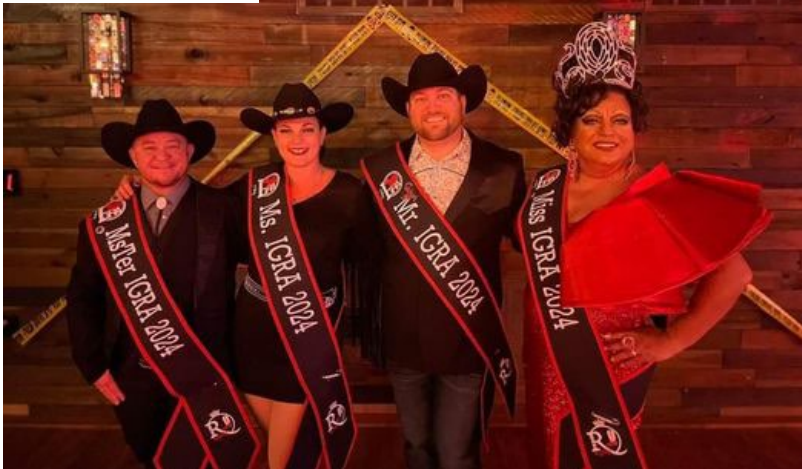
2024 IGRA Royalty