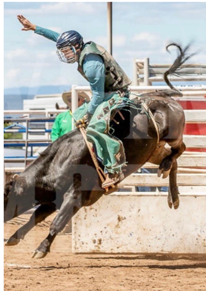
Men's Bull Riding