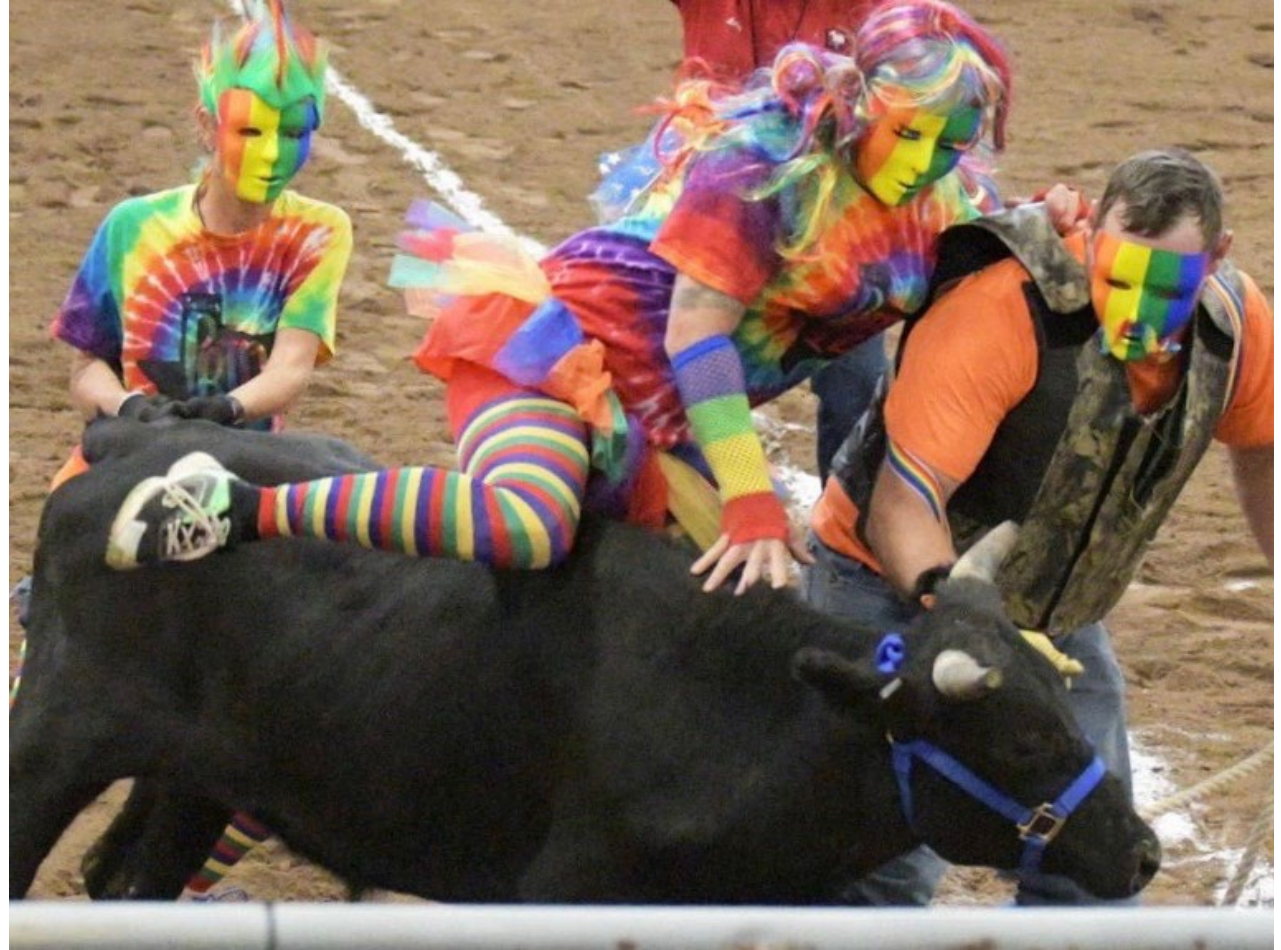
Wild Drag Race

Sponsor packages can also be tailored to specifically meet your needs.