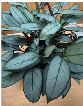
2 nd Ctenanthe Felicity Hill