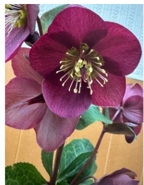
2 nd Hellebore Val Cotterrell