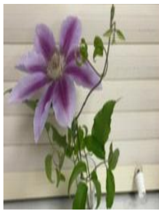
Clematis Alison Watson 2nd