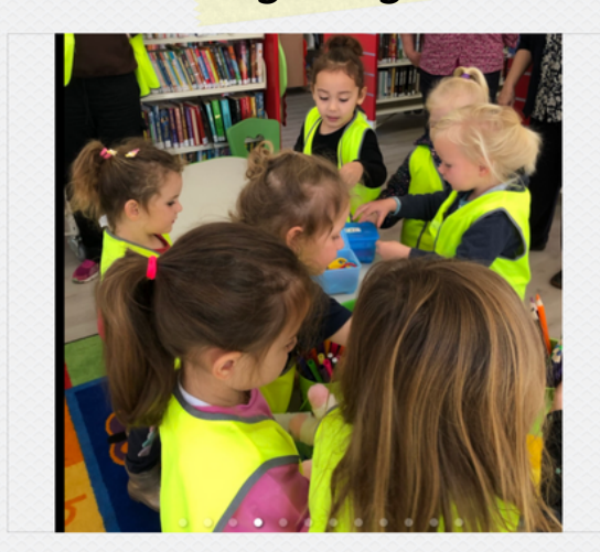
Rhyme Time at the Library