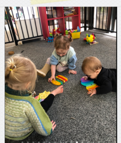
Babies developing friendships