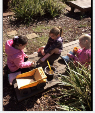
Nature Play Ground