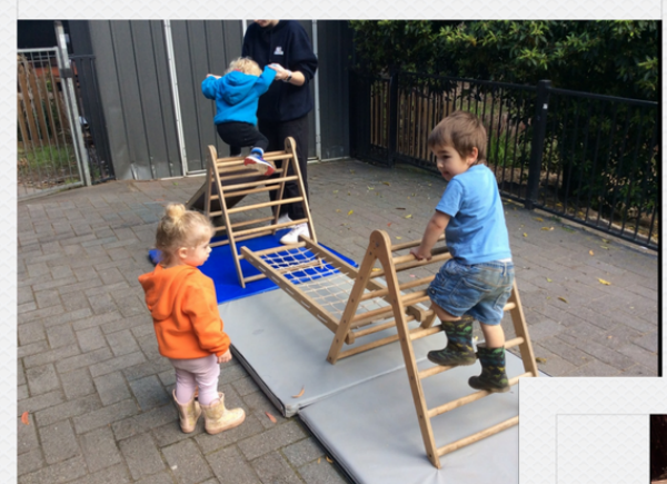
Gross Motor Development and Balancing Skills